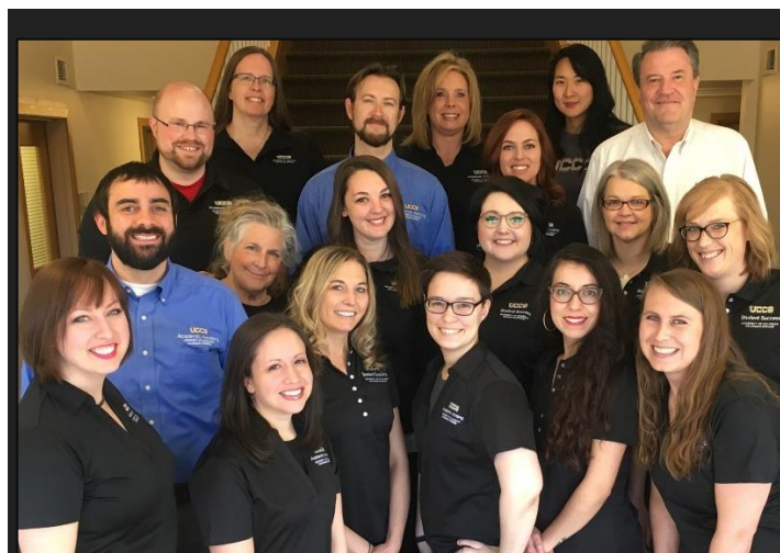
UCCS ACADEMIC ADVISING TEAM