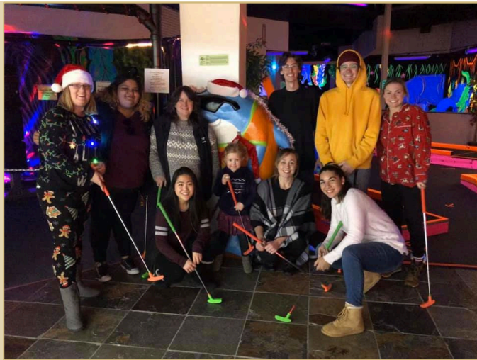
The Career Services Staff and Student Employees celebrate the end of the Fall semester.