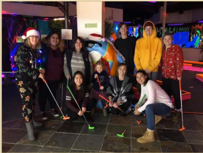
The Career Services Staff and Student Employees celebrate the end of the Fall semester.